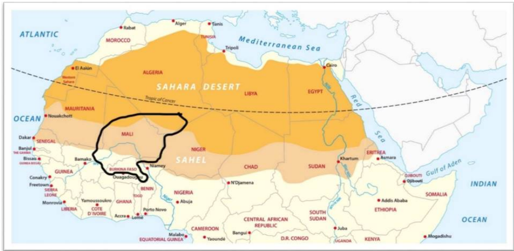
The Sahel-Sahara and the Conflict Zone. © Rainer Lesniewski